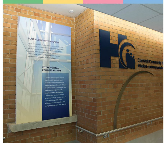
(located on Level 1)